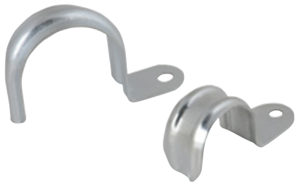
1 Hole Steel Saddles (Hot Dipped Galvanised)