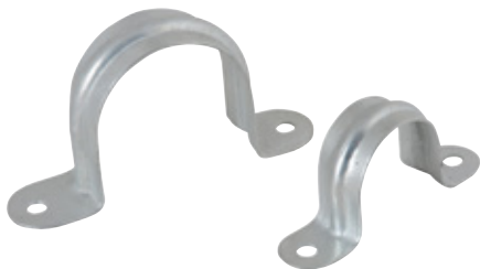
2 Hole Steel Saddles (Hot Dipped Galvanised)