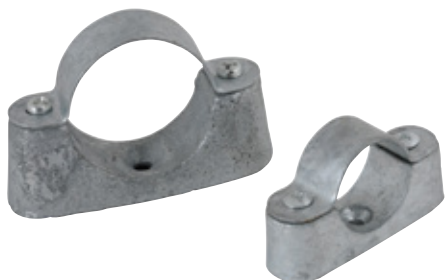
2 Hole Steel Saddle with Spacer (Hot Dipped Galvanised)